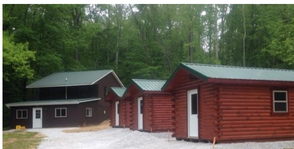
Silver Beaver Lodge and 3 log cabins.