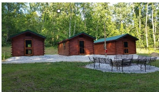
View of fire ring.