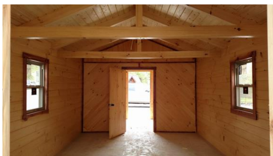
Inside the new log cabins.