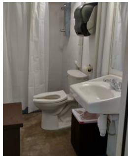
Yes! Real Flush Toilets.

The new Silver Beaver Village is available for rent. The fee is just $5.00 per person per night or weekend. We have three cabins available. Each sleeps 8 youth and two adults. The cabins are heated and sit right next to the Silver Beaver Lodge which has restroom and shower facilities and a gathering space with refrigerator sink and microwave. Bring your unit out to enjoy camp any time of year! Call the Scouting resource center to make your reservation: 740-453-0571